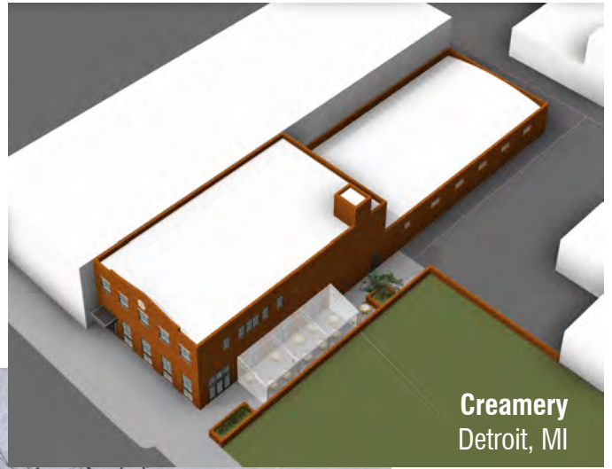
Creamery Detroit, MI