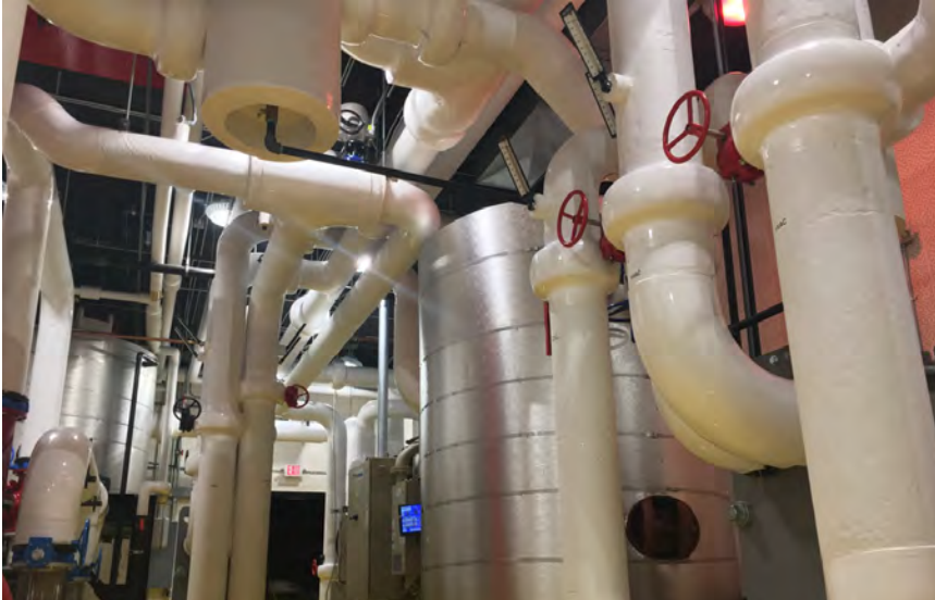
Third Man Vinyl Detroit, MI