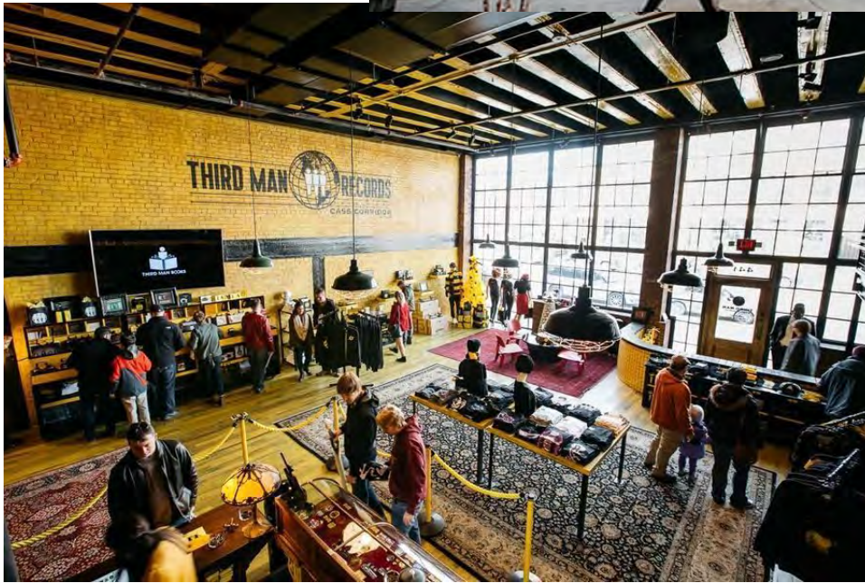
Third Man Records & Vinyl Detroit, MI