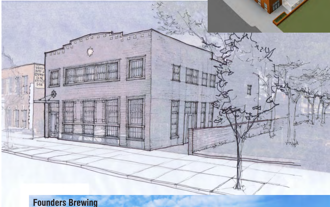
Founders Brewing Detroit, MI