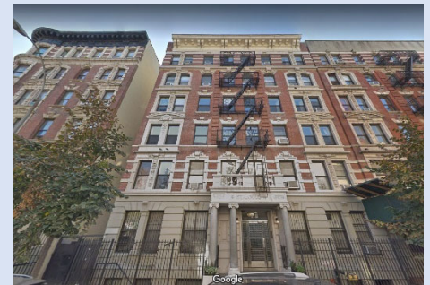
118 W. 112 th St. Harlem, NY