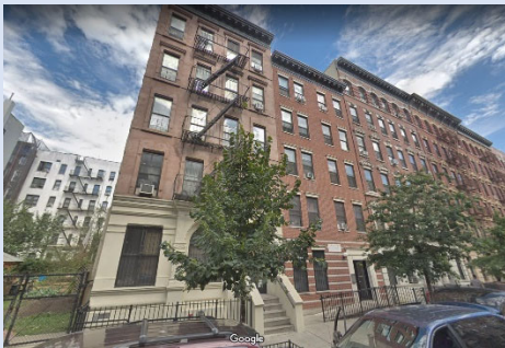
115-119 W. 137 th St. & 2228 7 th Ave. Harlem, NY

Gut Renovation and New Construction 59 Affordable Apartment Units